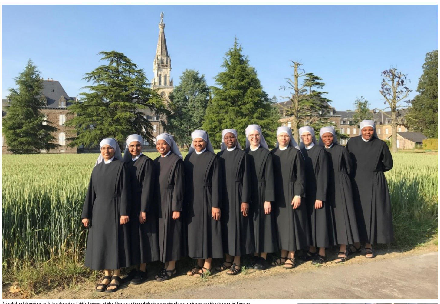
A joyful celebration in July when ten Little Sisters of the Poor professed their perpetual vows at our motherhouse in France.