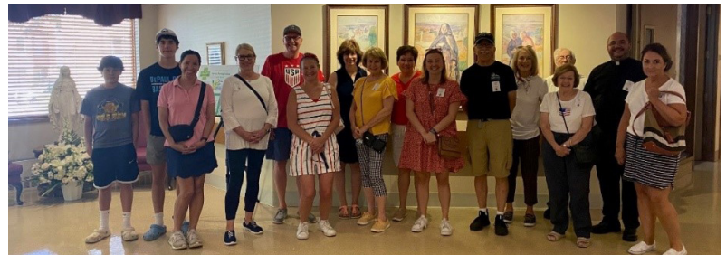
Friends from St. Josaphat Parish pose for a "quick pic" before heading outside to help with the cookout.